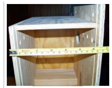
Box is Near 7 Inches Across