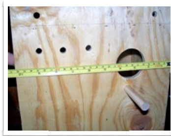
Box is 10 " Wide The hole is 2 inches Wide, Small Holes Can Ventilate Boxes