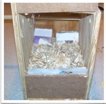
Then Line Box With Aspen Shavings