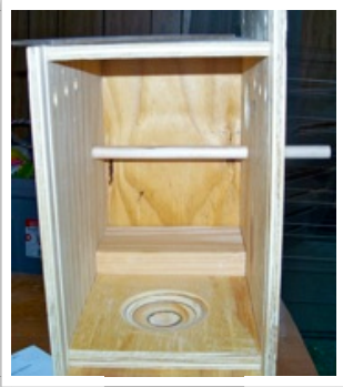
Box With Hole Linnie Nest Box With Hole. The dip or hole is not necessary but it helps.

Please remember that the ideas and nest boxes shown here (click) are what has worked for me. Other breeders have had wonderful success with other types of material and types of nest boxes. There is no one way or formula for success.